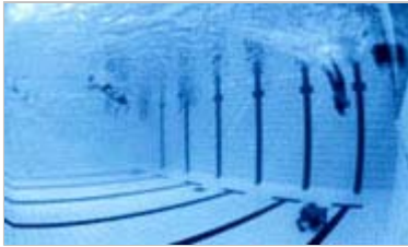
Poseidon uses eight underwater cameras to track swimmers